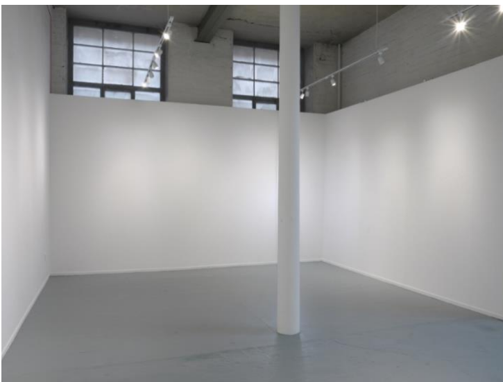
Back Gallery Space (Image 1)