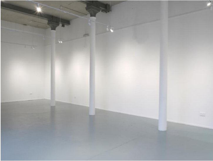
Front Gallery Space (Image 1)