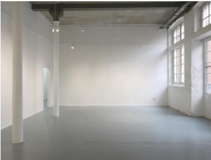
Front Gallery Space (Image 2)