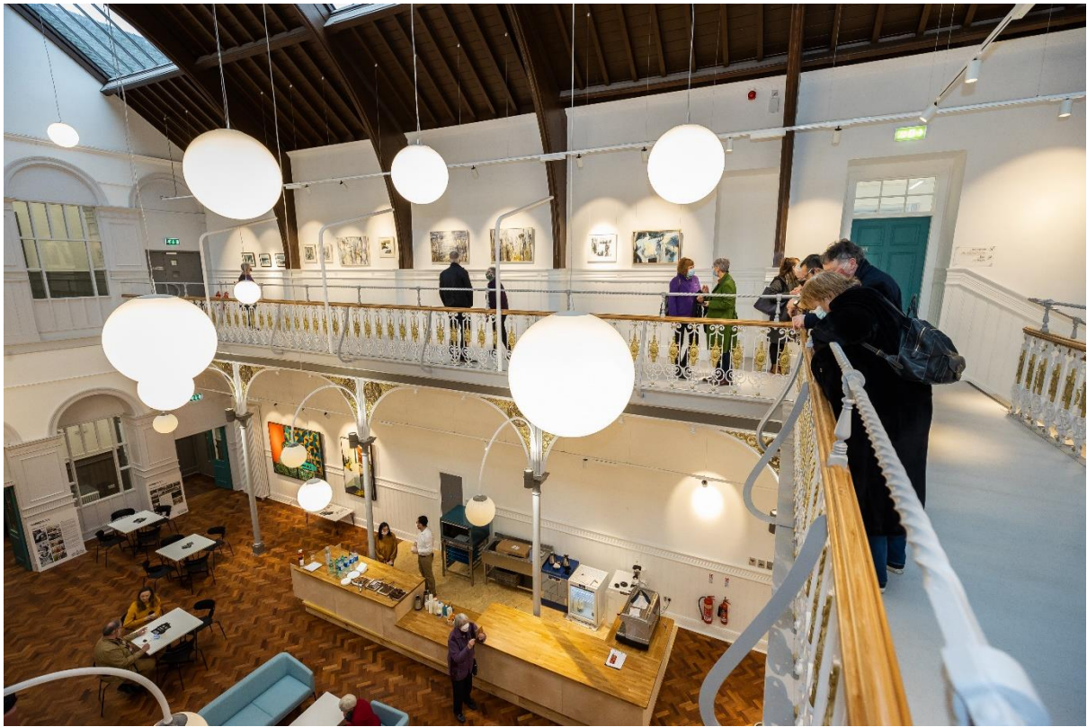
'IV5', Group Show, photography by Paul Campbell